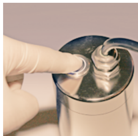
LumiStar2000 USL 15/35 featuring a programmable on/off switch.